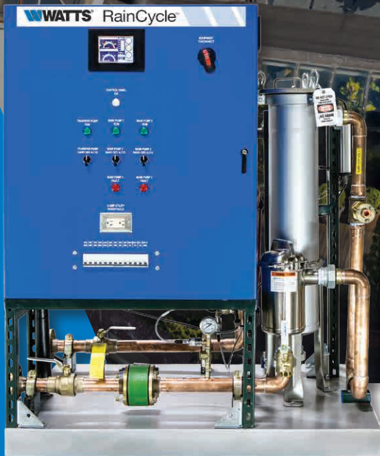
RainCycle™ rainwater harvesting systems

Leading the Way with Sustainable Water Solutions